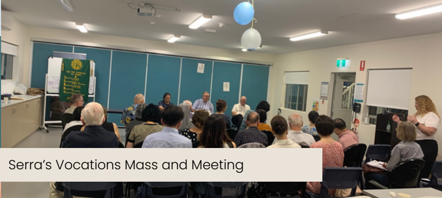
Serra's Vocations Mass and Meeting