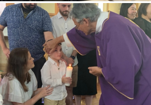
Congratulations to these very cute candidates who got baptised last week